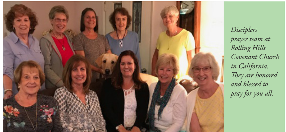
Disciplers prayer team at Rolling Hills Covenant Church in California. They are honored and blessed to pray for you all.